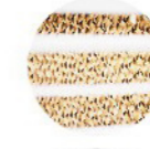
Efficient wet membrane