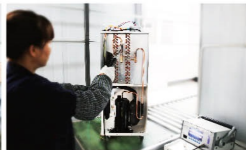
Halogen Leak Detector