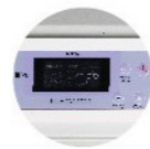
Large LED digital screen display