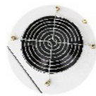
Low noise supply fan