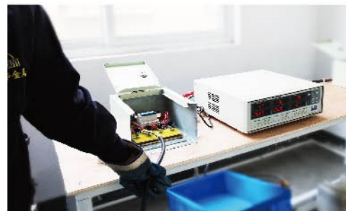
Current/Voltage Index Tester