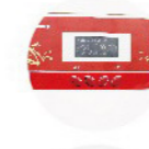
Large LED digital screen display