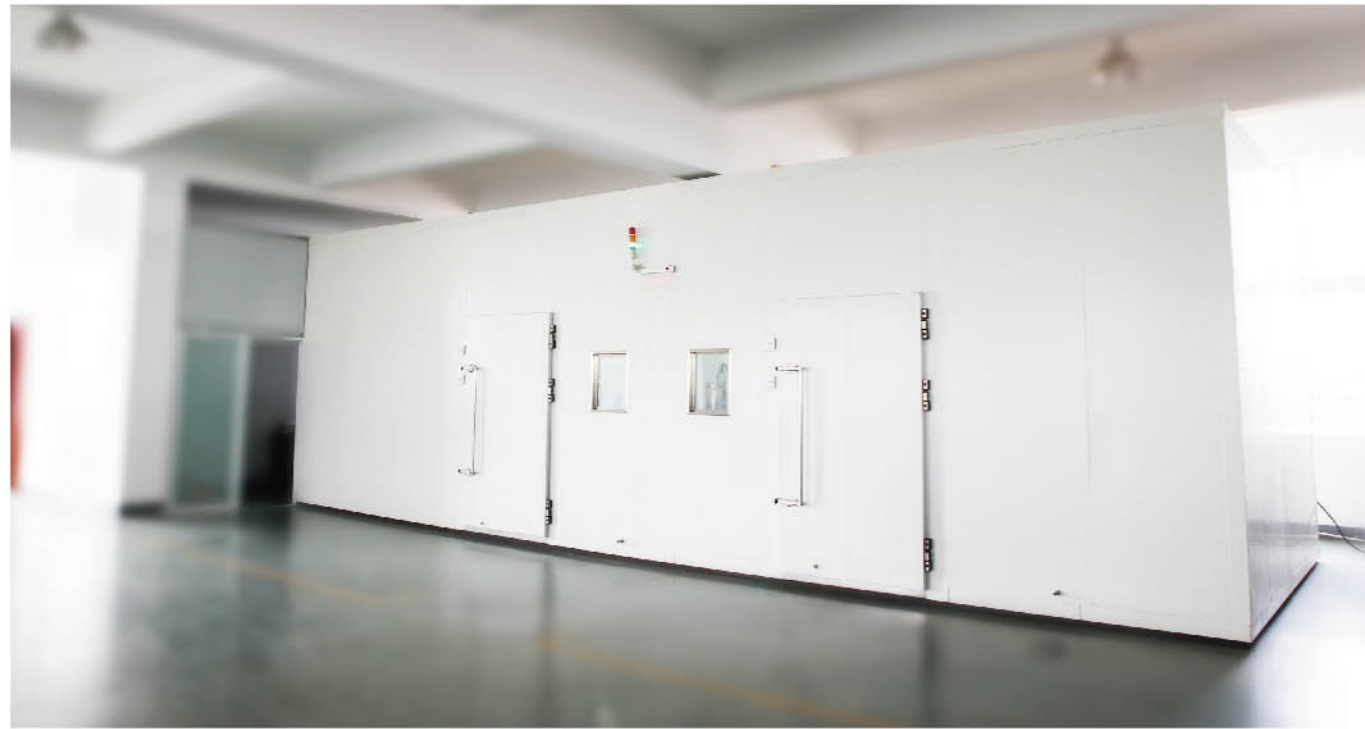
National Standard Enthalpy Testing Room

"Quality is the fundamental element of the company; Quality is the life of the company; Quality is the soul of the company" is Kawasima's philosophy. Honesty is the principle of the company. Kawasima is committed to provide the users high quality product and in time after sale service.