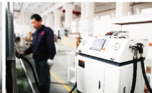
Automatic Refrigerant Charge Machine