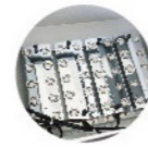
Efficient mist maker