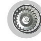
Low noise supply fan