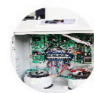
Microcomputer control system